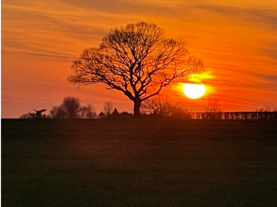
Photo: Sunset over Stoke Prior

From the Editor: Did you know there are emus up near Westhope Common? I went for an amble in the sunset, and on the way passed a pair of emus, a turkey, some guineafowl, a handful of bantams, and some very fine rabbits. If you're after a stunning quiet walk, the common land is beautiful and the views spectacular. If you have news to share, articles of interest, or can help create or distribute The Pump , email me on editorpump@hfspgroupparishcouncil.gov.uk by April 14, 2026 .