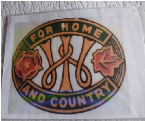
Photos from the WI meeting