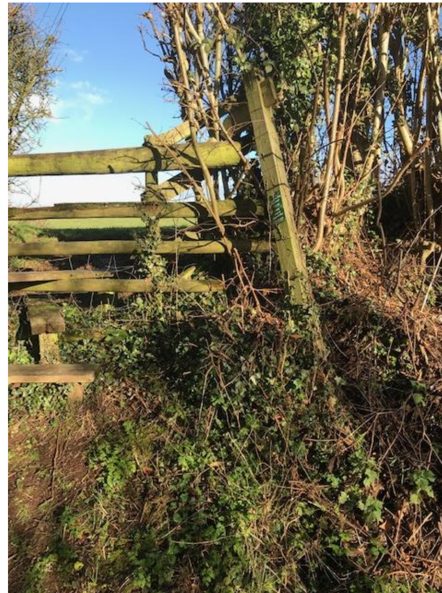
SP21 Broken Fingerpost sign