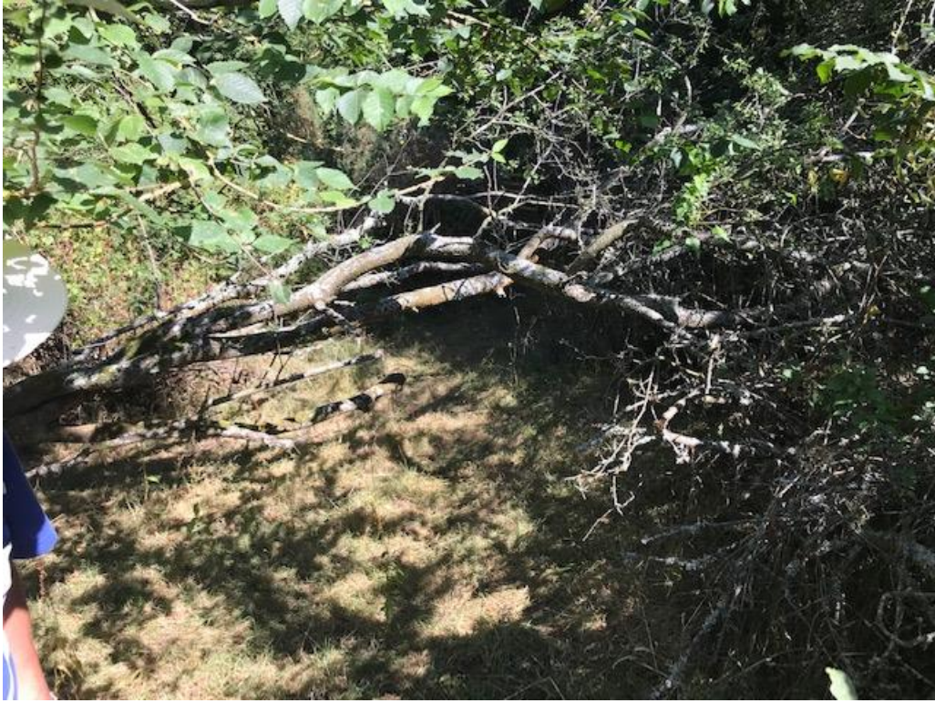
SP10 Fallen branches blocking the path