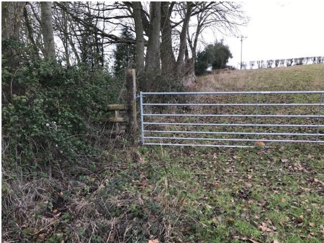
Locked gate / No stile SP4